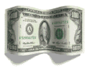
Follow the money!

https://www.co.door.wi.gov/DocumentCenter/View/4547/Final-Supervisory-Maps-Combined-2022-2031